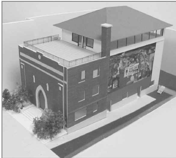
PARAMOUNT EAST REBORN. Fourmen Construction has created this model of the Paramount East building to show what the structure will look like when it is rebuilt.

A significant landmark in the City of Peekskill, the Paramount Theatre recently upgraded its heating and ventilation system to ensure proper regulation of the temperature inside the building. Displayed in front of the building and cemented for prosperity are the names of the patrons and sponsors who assisted the Paramount Center for the Arts Board in its unique fundraising efforts. Plans are underway to improve the facade of the building. This will increase the visibility of the Theatre and its role as catalyst for economic activity within downtown Peekskill.