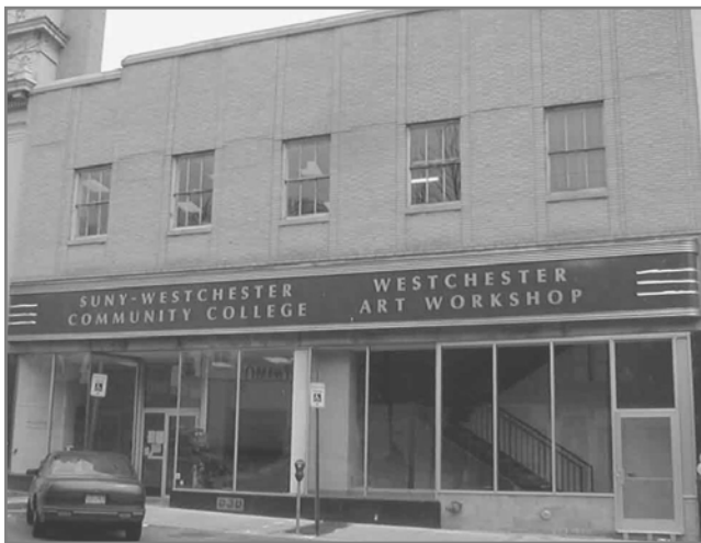
COLLEGE GROWS. Westchester Community College's Peekskill extension has proven so successful that it has had to expand to another full floor at 27 North Division Street.

In our next issue, we'll take a close look at some of the exciting residential projects that are underway in our city.