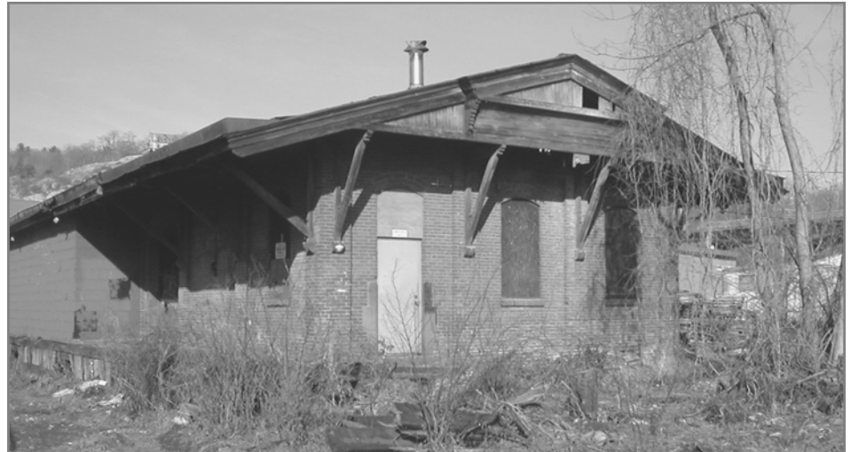
SOON TO BE A MUSEUM. This dilapidated structure will soon become a museum honoring Peekskill's contribution to the Civil War and the legacy of Abraham Lincoln.

building will be redeveloped to include a piano showroom, recital and gallery spaces. Renovations are underway and the project is expected to be complete within one year from the date of closing. By finally putting this property into private hands after many years of failed attempts, the City has not only broadened the tax base but has added another important structure to be restored and contribute to the revitalization efforts.